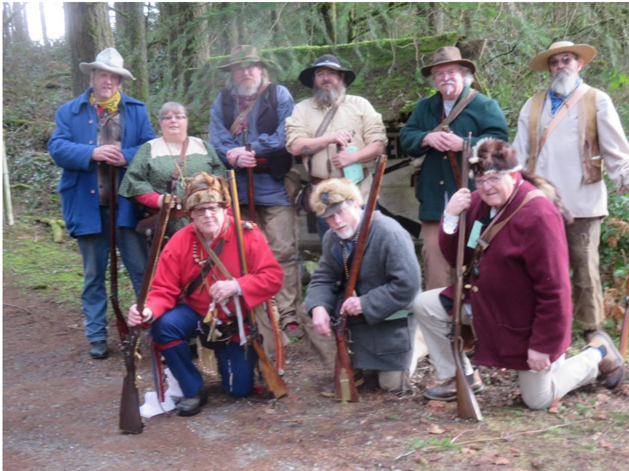
Here's part of the crew